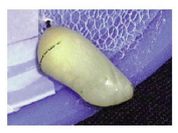
Fig. 3 — Pupa of D. chrysippus from eggs collected in Lampedusa and reared in laboratory (Photo: P. Zito).

dealing with the ecology and taxonomy of the family (e.g. ALBERS & MEVE, 2002) still recognise and use Asclepiadaceae as a valid family. In this paper Asclepiadaceae are being treated as a family, in accordance with ALBERS & MEVE (2002), and OLLERTON (2003). C. europaea has quadrangular stems, the younger ones are green and have small leaves that soon wither while the old-