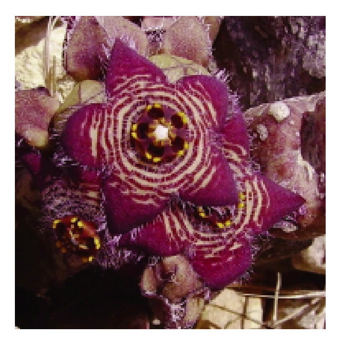
Fig. 5 — Flowers of C. europaea.

est ones look greyish. It forms large clumps up to 15-20 cm in diameter. Flowers are red-brown with yellow stripes or streaks, 10-15 mm in diameter. The corona is normally purplish (Fig. 5) (SAJEVA & COSTANZO, 1994). Fruits are follicles that at maturity dry out. Plants growing in rock crevices usually have a central erect stem and many smaller ones more or less procumbent, while