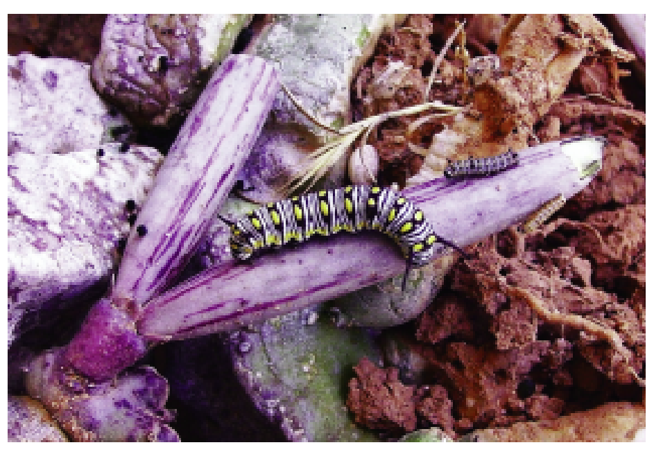
Fig. 8 — Caterpillars of D. chrysippus feeding on follicles of C. europaea . (Photo taken in laboratory: P. Zito).

Plumbaginaceae. Among Asclepiadaceae the following taxa have been reported as host plants for larvae of D. chrysippus: Asclepias, Aspidoglossum, Brachystelma, Calotropis, Caralluma, Ceropegia, Cynanchum, Gomphocarpus, Huernia, Ischnostemma, Kanahia, Leichardtia, Leptadenia, Marsdenia, Metaplexis, Pachycarpus, Pentarrhinum, Pentatropis, Pergularia, Periploca, Pleurostelma, Raphistemma, Rhyncharrhena, Sarcostemma, Schizoglossum, Secamone, Stapelia, Stathmostelma, Tylophora (Ackery & Vane-Wright, 1984; Vane-Wright & DE Jong, 2003). Within the genus <i>Caralluma , only C. burchardii (Brandes, 2005) has been recorded at specific level as forage plant for D. chrysippus . Our record is the first for the species C. europaea as fodder for D. chrysippus .