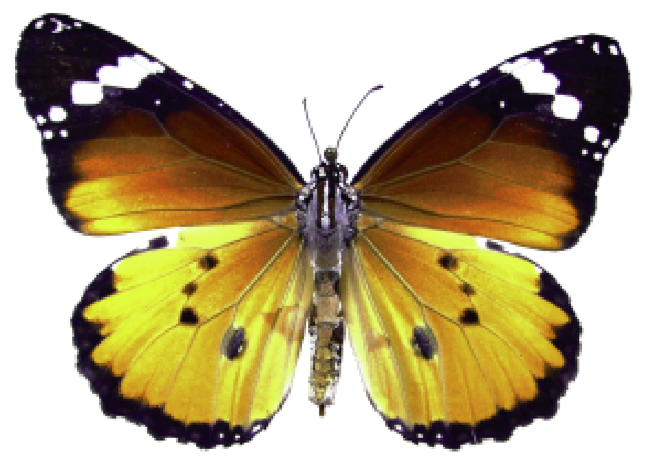
Fig. 1 — Specimen of Danaus chrysippus from pupa reared in laboratory.

volatile dihydropyrrolizines, some of which may play a specific role in courtship behaviour (FRANCKE, 1989).