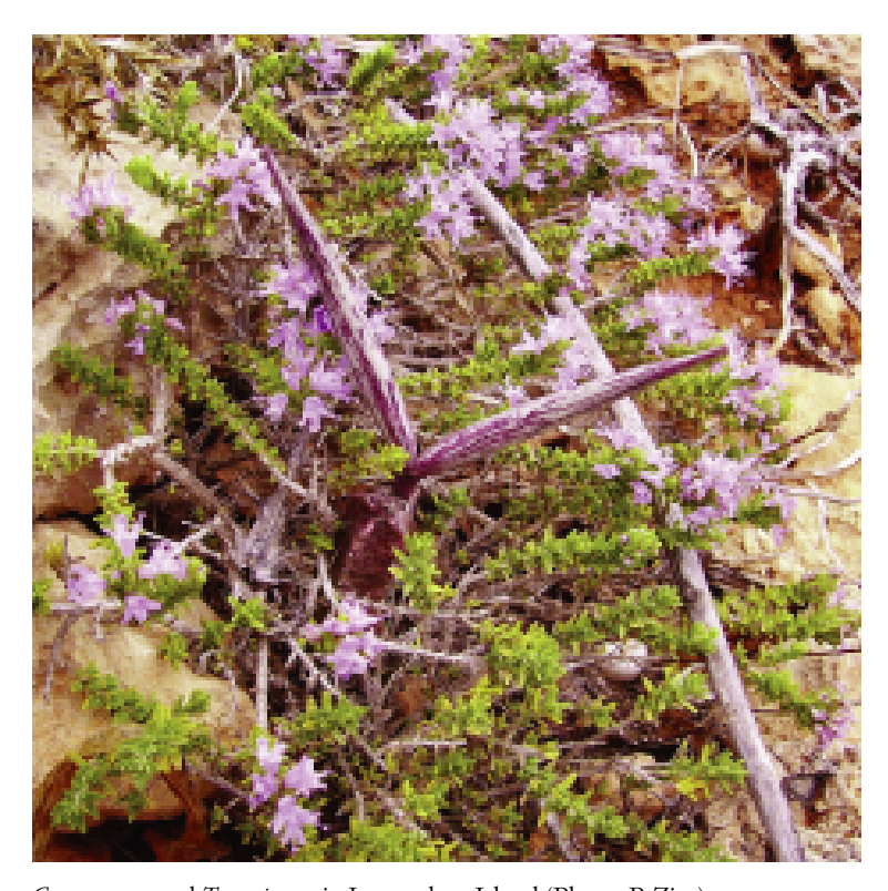
Fig. 7 — C. europaea and T. capitatus in Lampedusa Island.

Five larvae and five eggs have been collected monthly to observe the feeding behaviour. Eggs and larvae were reared in plastic boxes placed in a thermostated room at 25 \pm 2 °C illuminated with 100 µmol m<sup>-2</sup> flux and a photoperiod of 16/8 light/dark hours. To study food preference, as source of food they were supplied with stems, follicles or stem with follicles of C. europaea collected in Lampedusa and cultivated at the Botanical Garden of Palermo. The process of complete metamorphosis of D. chrysippus has been observed in controlled conditions. After the emergence, the adults were mounted and stored in entomological boxes at the Dipartimento di Scienze Botaniche.