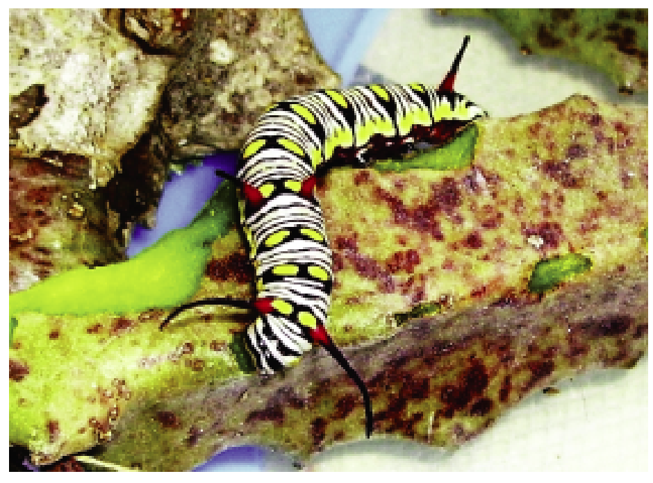
Fig. 2 — Larva of D. chrysippus feeding on stem of C. europaea under laboratory condition (Photo: P. Zito).

dealing with the ecology and taxonomy of the family (e.g. ALBERS & MEVE, 2002) still recognise and use Asclepiadaceae as a valid family. In this paper Asclepiadaceae are being treated as a family, in accordance with ALBERS & MEVE (2002), and OLLERTON (2003). C. europaea has quadrangular stems, the younger ones are green and have small leaves that soon wither while the old-